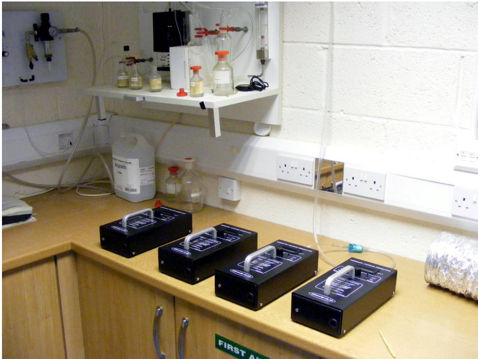
Ion Science Limited Calibration Room

For further information please contact our Service Department on + 44 (0) 1763 208503 or via email on service@ionscience.com and they will be pleased to assist you.